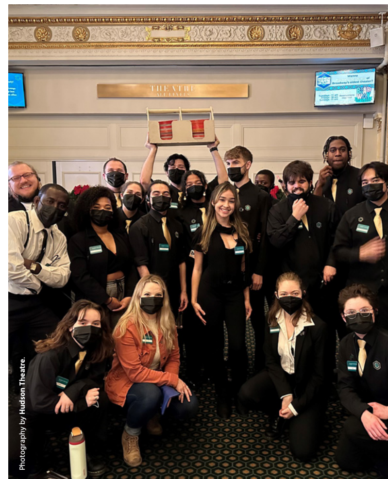
Photography by Hudson Theatre.